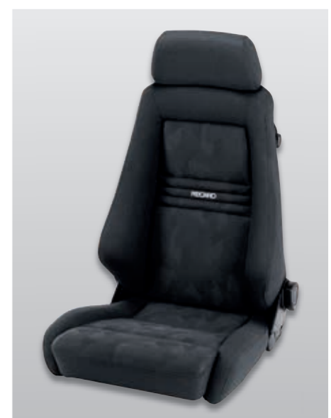
RECARO Specialist M