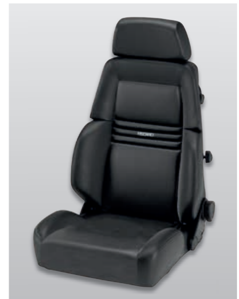
RECARO Expert S